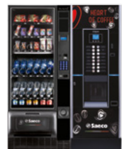
Artico S + Cristallo Evo 400